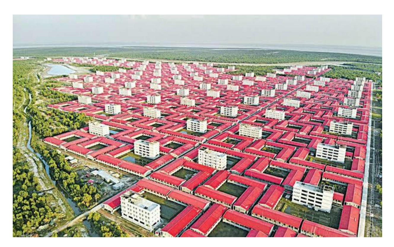
Office of the Additional Refugee Relief and Repatriation Commissioner Bhasanchar, Hatiya, Noakhali